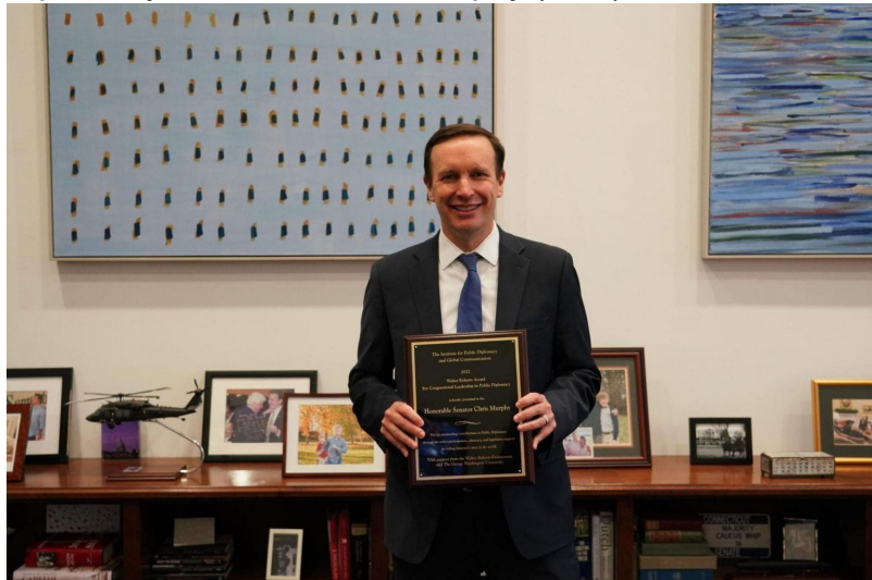
Senator Chris Murphy with his award.

In March 2022, we presented the fifth annual Walter Roberts Award for Congressional Leadership in Public Diplomacy to Senator Chris Murphy (D-Ct) in a virtual event .