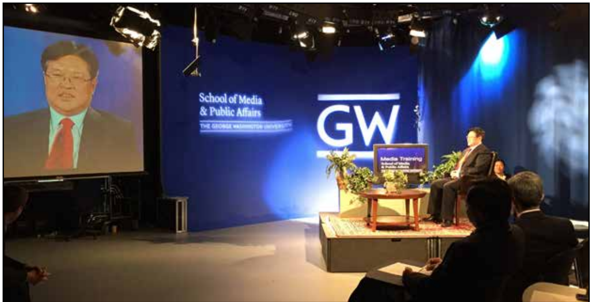
A member of the delegation of Chinese government spokespeople gets on camera in the SMPA broadcast studio for a live interview critique and feedback session.

Executive education: Media training for the delegation of Chinese government spokespeople